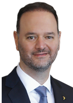
Chairman of the Board Title: Director